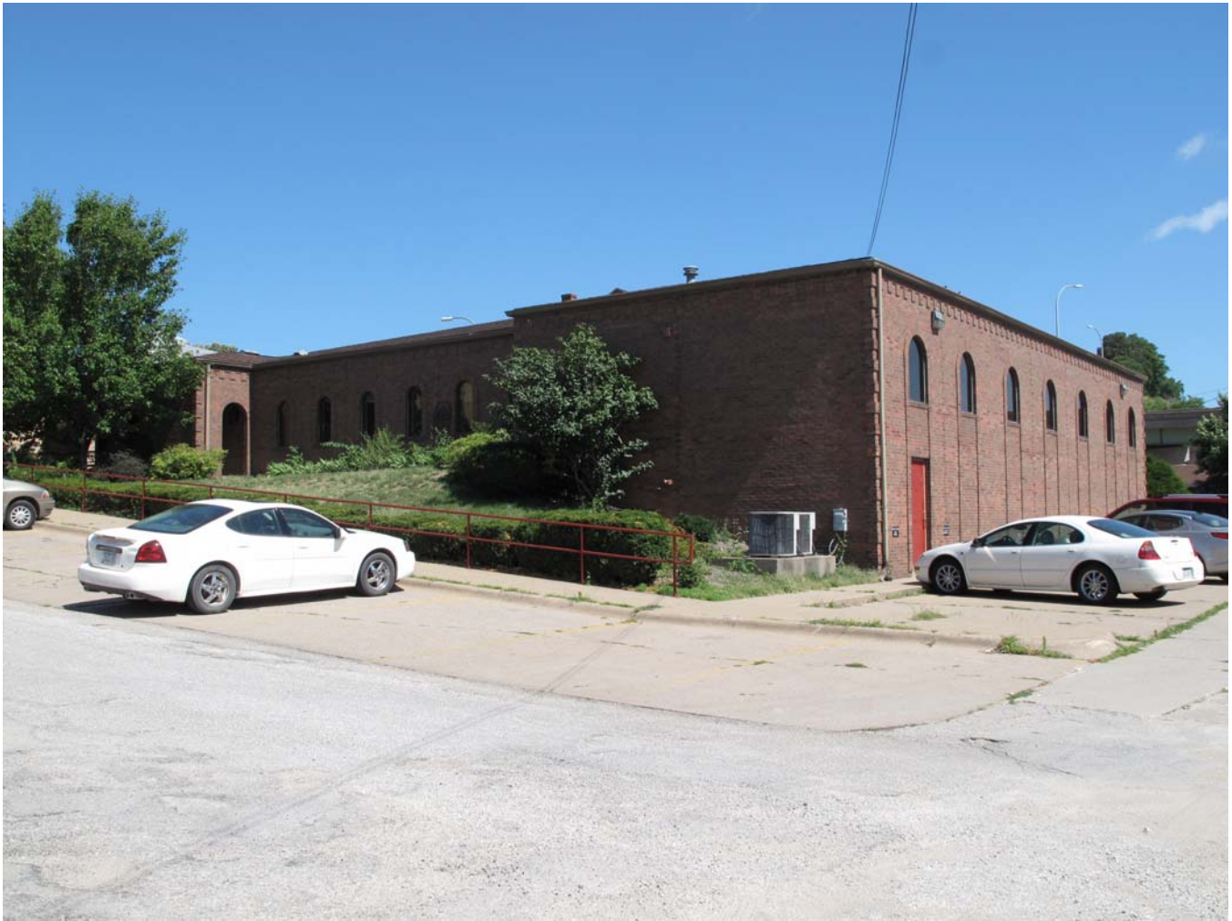
Photograph 29-03666-002 – South and east (rear) elevations, looking northwest.