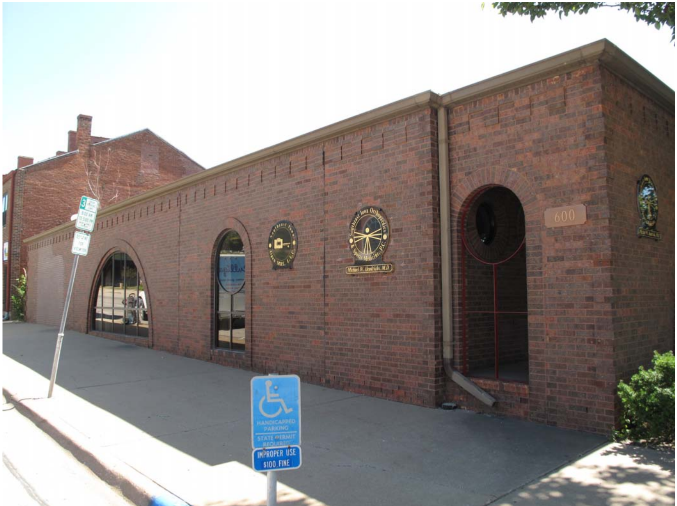
Photograph 29-03666-001 – West (front) elevation, looking northeast.